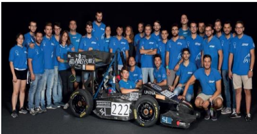
UNINACORSE UniNa Formula Student racing team - 1st place overall at Italian edition of Formula SAE world championship 2023 Varano de' Melegari 16/7/2023

Internship opportunities are available to all graduating students. For example, some companies where curricular internships are carried out include: 3DNA, Abete, ADLER Plastic, Aerosoft, Blue Engineering, Daca-i, DEMA, GE Avio, Hitachi Rail, LAER Aeronautica, Laminazione sottile, Leonardo, LMC, Nashira Harmetals, Officine Meccaniche Pontillo, OMPM, SophiaTech, Stellantis, Tecnosistem, etc.